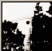
Wide open spaces