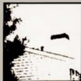
Cape Cod Design